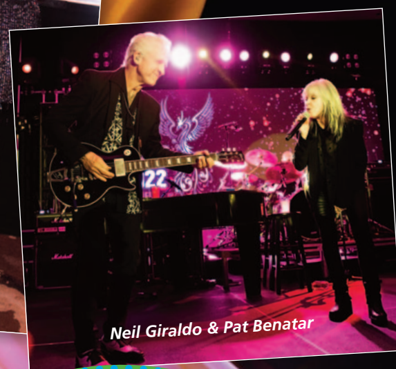
Neil Giraldo & Pat Benatar